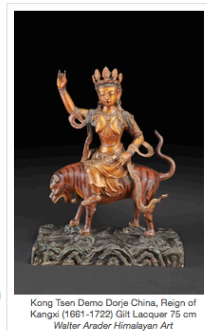
Kong Tsan Demco Dorje China, Reign of Kangxi (1661-1722) Gilt Lacquer 75 cm Walter Arader Himalayan Art